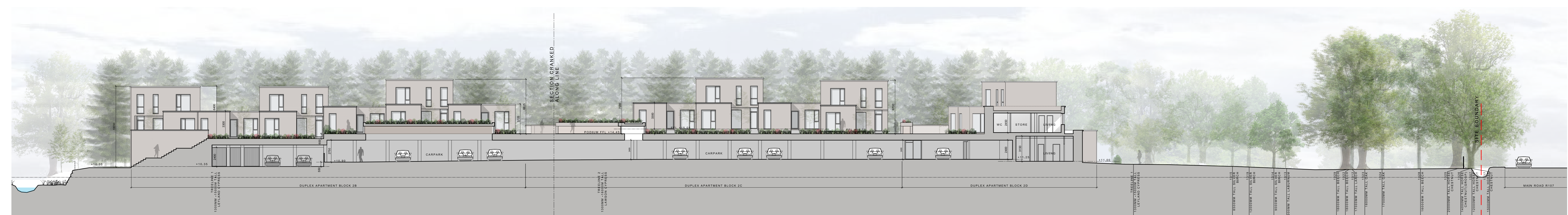
SITE SECTION U - U SCALE: 1:200 NOTE: SEE LANDSCAPE ARCHITECTS DRAWINGS FOR BOUNDARY TREATMENTS SEE ARBORISTS REPORT FOR DETAIL ON EXISTING TREES DOTTED RED LINE INDICATES SITE BOUNDARY