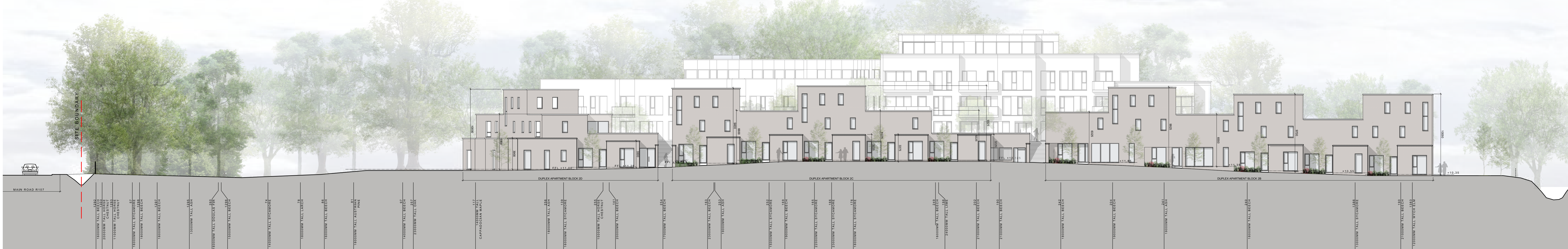
SITE SECTION R - R SCALE: 1:200 NOTE: SEE LANDSCAPE ARCHITECTS DRAWINGS FOR BOUNDARY TREATMENTS SEE ARBORISTS REPORT FOR DETAIL ON EXISTING TREES DOTTED RED LINE INDICATES SITE BOUNDARY SECTION CRANKED WHERE INDICATED TO GIVE TRUE ELEVATION OF DUPLIX UNITS - APARTMENTS BEYOND DISTORTED.