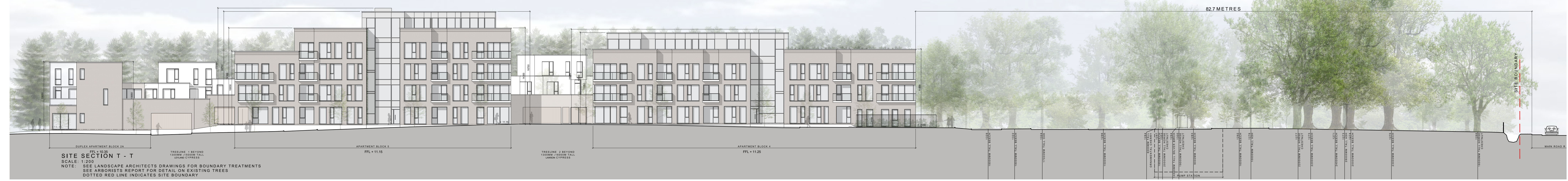
SITE SECTION T - T SCALE: 1:200 NOTE: SEE LANDSCAPE ARCHITECTS DRAWINGS FOR BOUNDARY TREATMENTS SEE ARBORISTS REPORT FOR DETAIL ON EXISTING TREES DOTTED RED LINE INDICATES SITE BOUNDARY