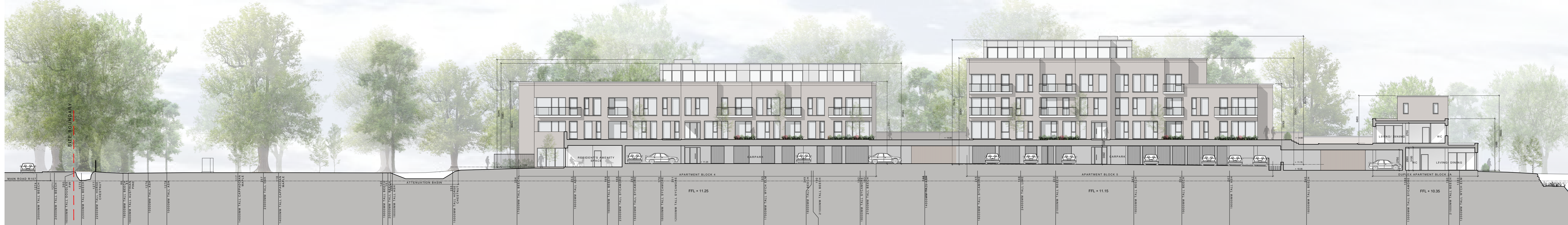
SITE SECTION S - S SCALE: 1:200 NOTE: SEE LANDSCAPE ARCHITECTS DRAWINGS FOR BOUNDARY TREATMENTS SEE ARBORISTS REPORT FOR DETAIL ON EXISTING TREES DOTTED RED LINE INDICATES SITE BOUNDARY