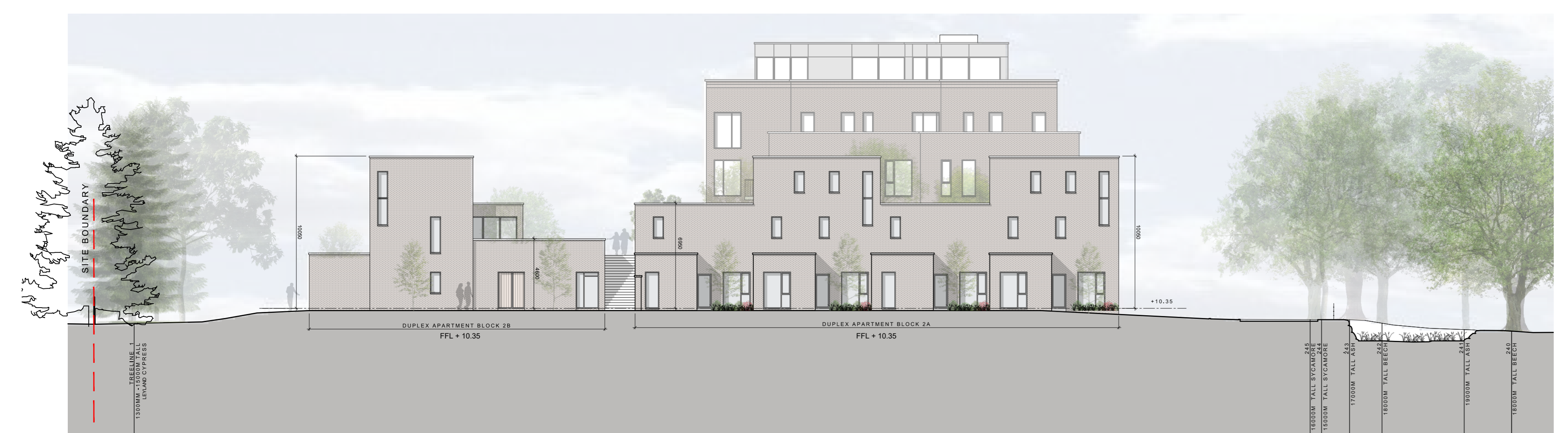
SITE SECTION V - V SCALE: 1:200 NOTE: SEE LANDSCAPE ARCHITECTS DRAWINGS FOR BOUNDARY TREATMENTS SEE ARBORISTS REPORT FOR DETAIL ON EXISTING TREES DOTTED RED LINE INDICATES SITE BOUNDARY